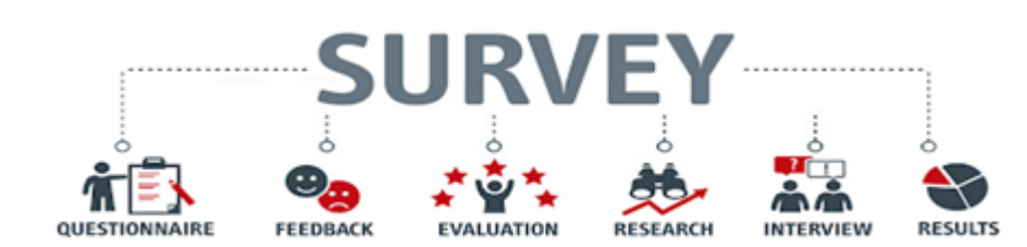
Figure 2. Primary Research Method

The present study utilizes quantitative research methodology, using the primary survey approach (Figure 2), to investigate the functionality of technology-based learning in increasing the linguistic and cultural competency of preservice teachers in Kazakhstan (Çobanoğlu, 2020). The Qualtrics survey tool is specifically built to collect data related to the different attributes that constitute linguistic and cultural competencies such as language proficiency, intercultural communication skills, and cultural awareness (Mukatayev, 2019). The sample included 65 male and 40 female students from various preservice teacher education programmes presented at different institutions in Kazakhstan. The purposive sampling method was used to select participants, thus ensuring that individuals from various linguistic and cultural backgrounds were included within the scope of Kazakhstan. The survey was conducted through the use of Qualtrics (Daniyarova, 2020).